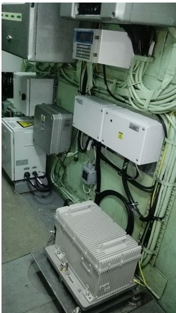
COMBATTANTE IIB Class