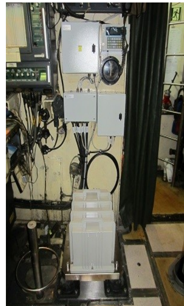
SUB 209 (GLAFKOS) Class